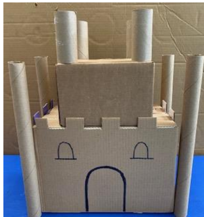
This is what I was thinking of when I started. I changed to the cracker box and left out the toilet paper rolls.