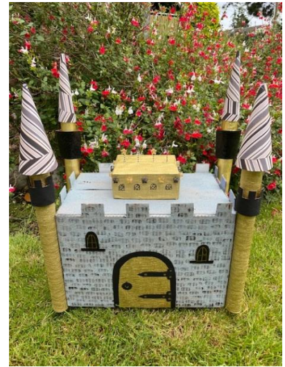
On the small box on top of the castle I added some star beads for decorations.