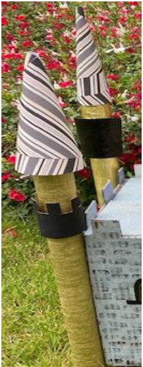
This is how the towers turned out.