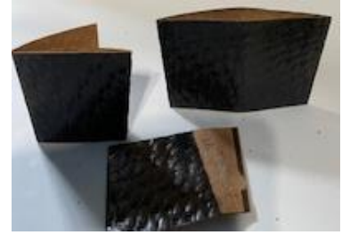
I painted the coffee sleeves and then cut to fit around wrapping paper rolls.