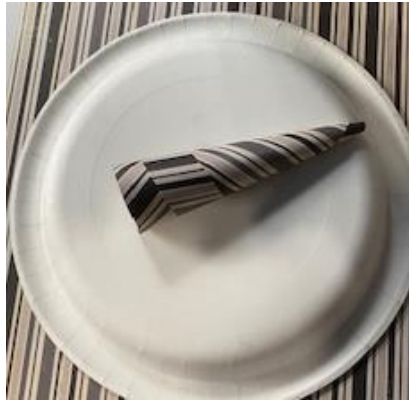
For the tops of towers I used a paper plate as a pattern. Twist the paper around so that it fits the wrapping paper roll.