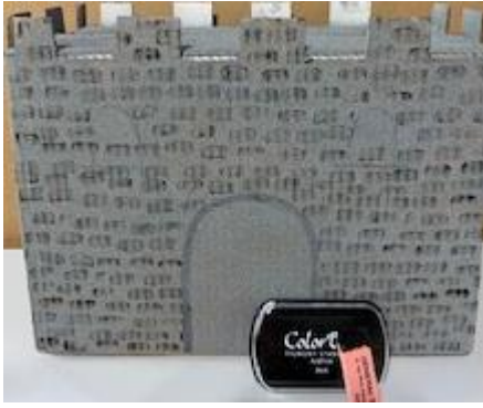
I painted the castle and used a stamp pad this time with my eraser.