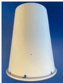
Punch 8 holes.