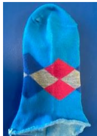
Cut sock and design face.