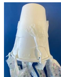
Cut out 8 legs from your bubble wrap mailer and decorate. Tie each one on and secure with tape.

Last step is to add the sock over the cup and secure with glue or staples. Now you can put your hand inside the cup and use as a puppet. Have a fun under the sea day blowing bubbles, wearing your mermaid tale and playing with your new octopus puppet!